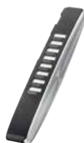
8-line Key Module