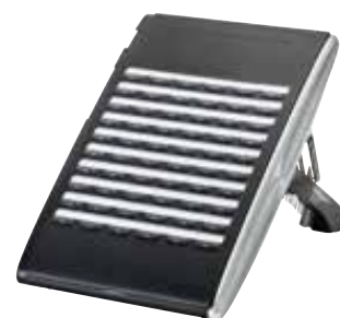
60-line DSS Console