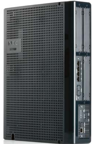
SL2100 Communications Server