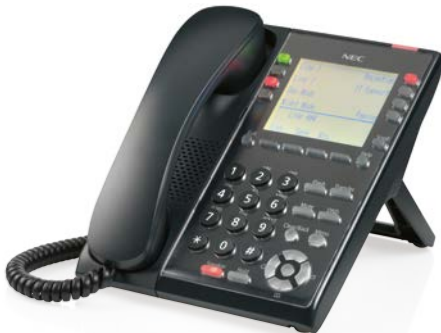
SL2100 IP Terminal