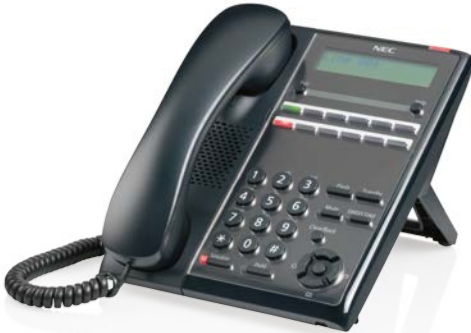
SL2100 Multi-line Terminals